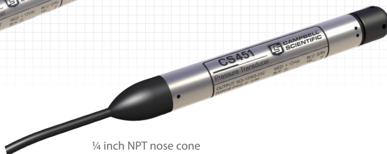
1/4 inch NPT nose cone