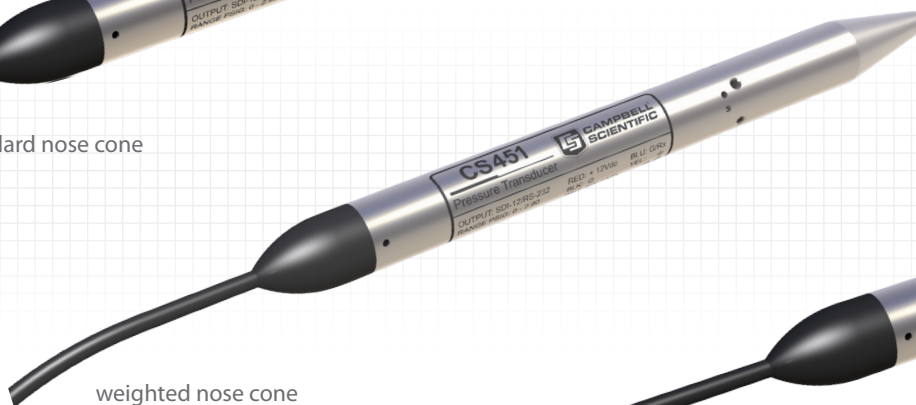
weighted nose cone