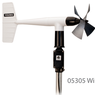
05305 Wind Monitor-AQ