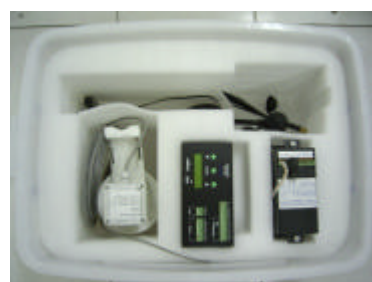
inner of movable polypropylene instrument box