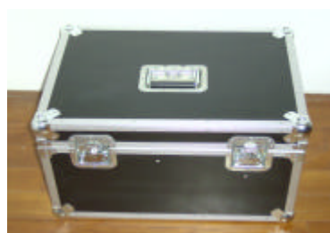
portable rugged instrument case @ L:58cm W:40cm H:35cm