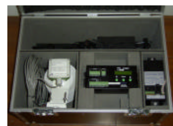
inner of portable rugged instrument case