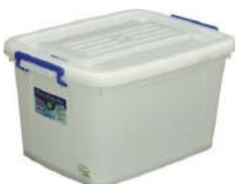
movable polypropylene instrument box @ L:69cm W:48cm H:39cm